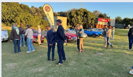
Our cars attracted a lot of attention