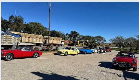
Breakfast stop at Alexandria