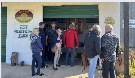
Old Petrol Station