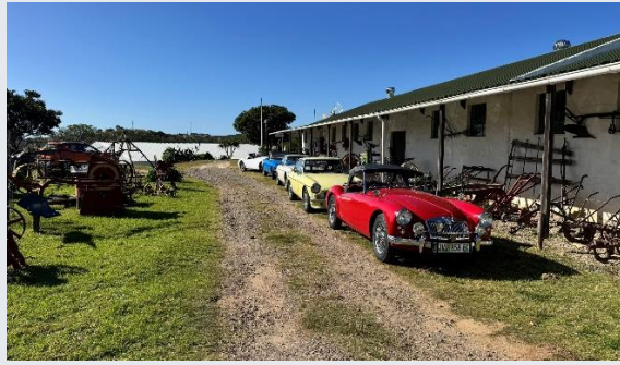
MGs at the Museum