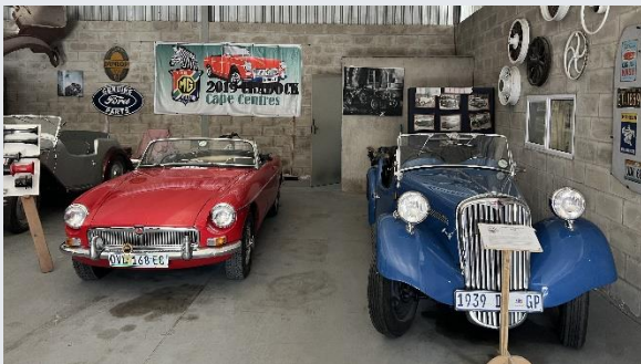
Most club members will fondly remember the banner