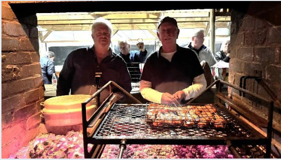
Our Friday braai masters