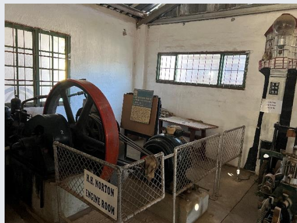
Old engine for the Fish River Lighthouse