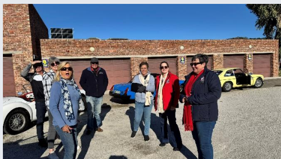
A frosty morning before leaving