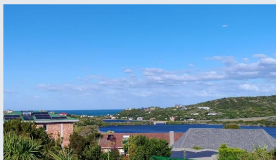
View from Manny's cottage