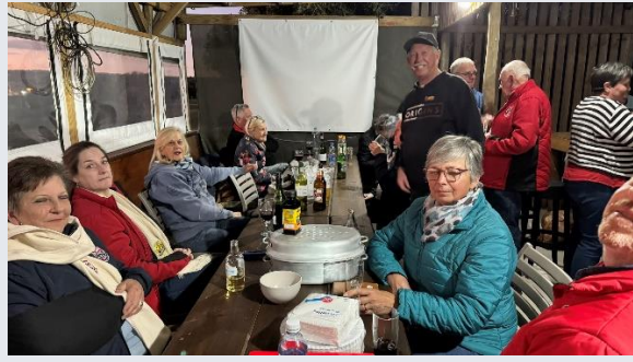
Friday socialising at the club