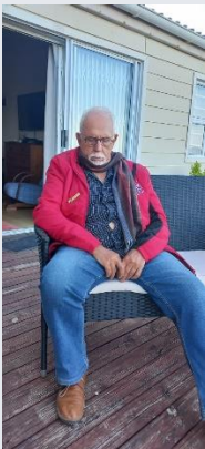
It was a loooong weekend!!