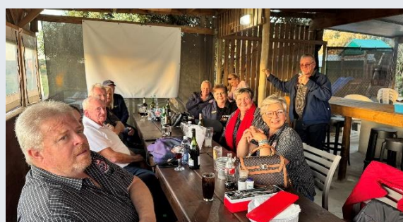
Golf club Saturday