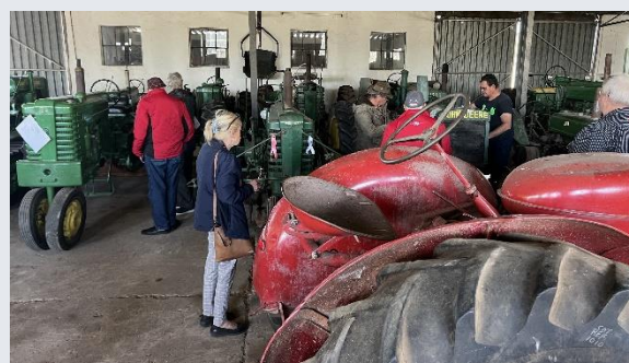
Lots of old tractors