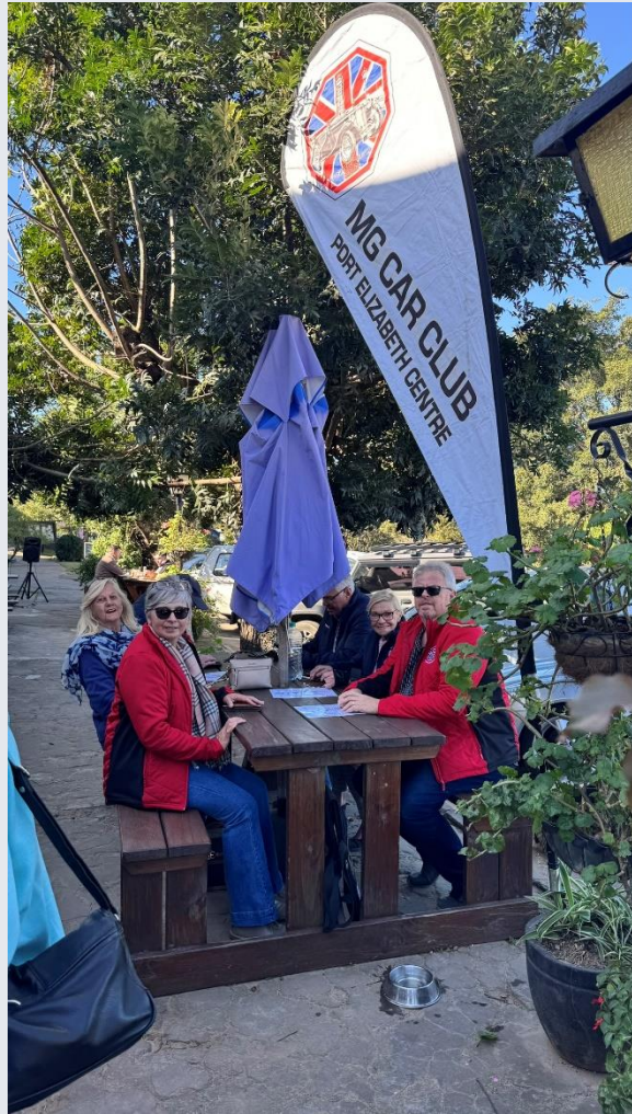
Lunch at the Pig and Whistle