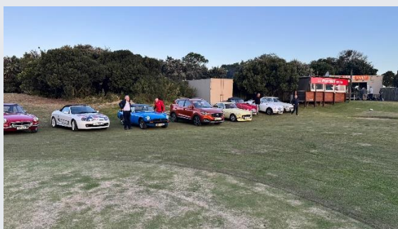
Our cars at the golf club on Friday