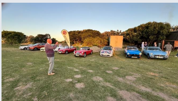
Kleinemonde Golf Club Saturday