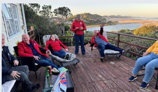
Chilling at the Cottage