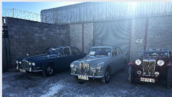
AVCMC Members' Cars