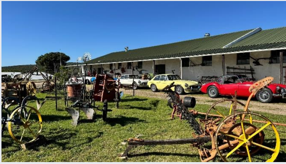
Bathurst Agricultural Museum