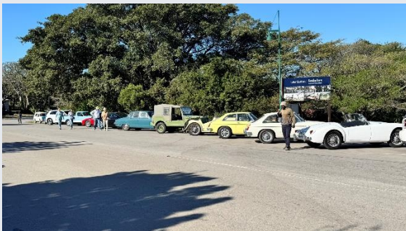
Our cars at the Pig