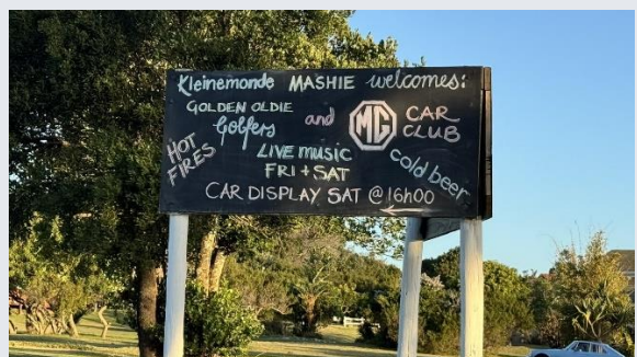
Our welcome at the Kleinemonde Golf club