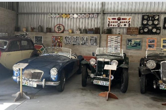
Some MGs in the museum